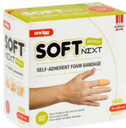
Soft NEXT Neutral 6 x 450 cm