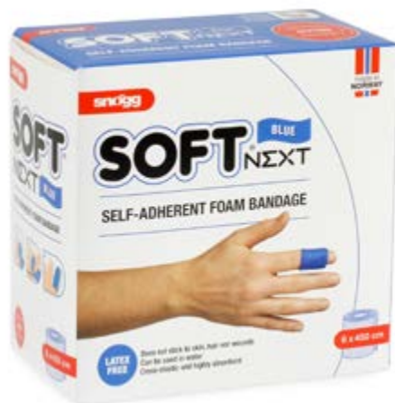
Soft NEXT Blue 6 x 450 cm

The blue version is highly visible and well suited for the food industry