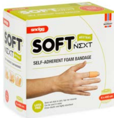
Soft NEXT Neutral 6 x 450 cm